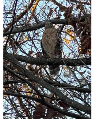
A hawk was spotted at Croft.