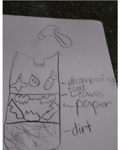
Keller 3rd grade