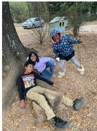
Log drama in after school!