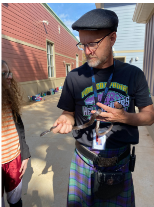
The Eastern black snake visited middle school.