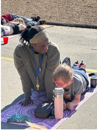
Autumn is the perfect season for outdoor yoga!