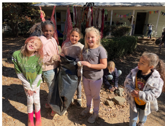
Middle school and elementary tudents doing stewardship duties and taking care of our campus.