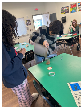
High School Earth and Environmental Science students are studying the geosphere. Last week they did a soil testing lab to learn about the health of soils.