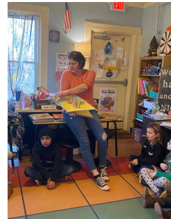
Ms. Crystal's third grade class is researching Egypt for World Heritage Day .