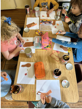
First grade prepared for the Thanksgiving Break with some leaf crafting.