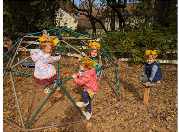
PreK watched birds, made butter, and crafted leaf hats.