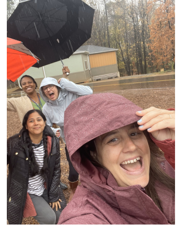
The fifth grade teaching team enjoyed the rain-at long last!