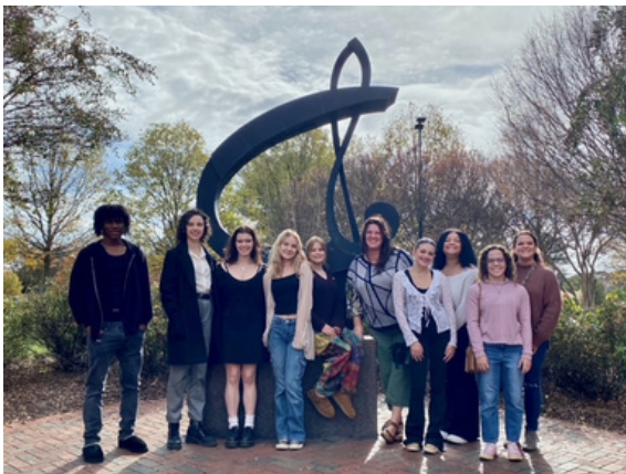
The High School dance class went to see the UNC-Charlotte Dance Department's Fall Concert featuring a dance that was inspired by the art work "Girl with a Pearl Earring", a Martha Graham dance reimagined along with other dances. We also encountered a robot delivering food.

On the November 27 Staff Development day the Kindergarten teaching team visited the Catawba Cultural Center to prepare for the January 12 World Heritage Day. We'd love your input for World Heritage Day- share your ideas here.