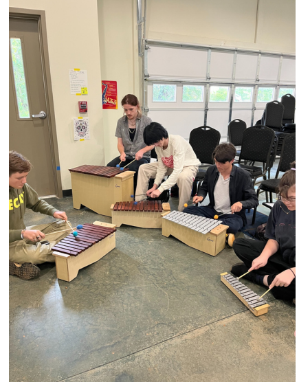
High School Music Theory 1 students using xylophone to practice identifying notes on a staff.