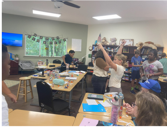
6th grade students seeing how far they can make a piece of paper stretch.