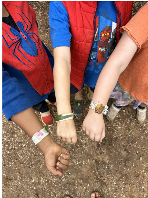
1st grade nature bracelets.