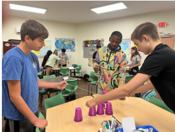
8th grade students completing a team building and engineering challenge.