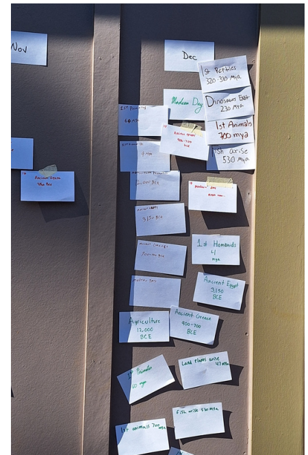
High school Astronomy students made a scale timeframe of the formation of the universe all the way to modern day into 1 calendar year. The students researched the timing of notable events like the Big Bang, the oxygenation of Earth's atmosphere, the first fishes, the rise of agriculture and others. They then worked as teams to decide where these events would fit on the cosmic calendar. Students were amazed to learn that all of human history would fit into the last 6 seconds of December 31st, 11:59 pm.