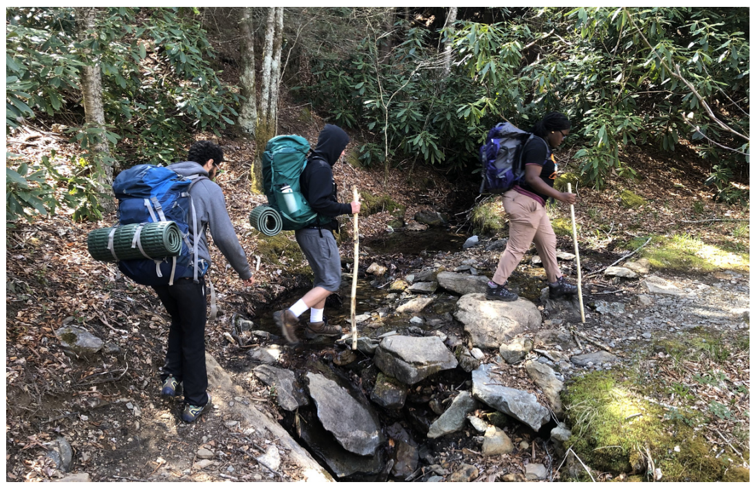
High School students backpacking in Piscah National Forest. PSCS students experience more complex and demanding academic, physical, and natural challenges as they get older.

You are cordially invited to join us for Pioneer 101: What Comes Next? on Thursday, March 28 from 5–6 pm.