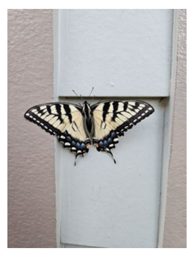
A butterfly visited the Hive!