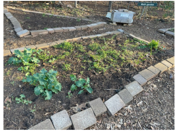
The 4th grade Math Garden is growing! Kale and garlic have both sprouted. Have you started your seeds yet? Share your garden preparations on social media and tag #pioneersprings.