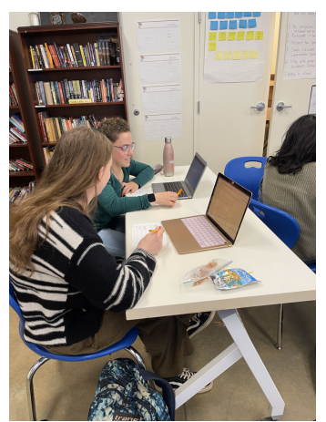
High school juniors write a research paper as a part of their Capstone Graduation Project. This week students engaged in peer review.