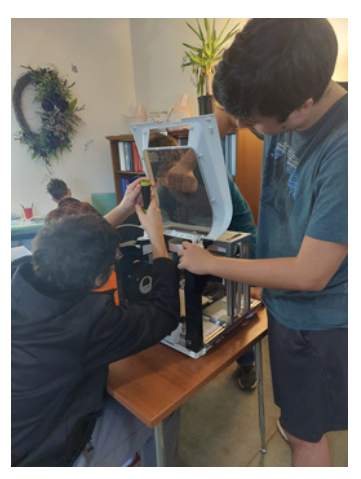
In Explore! class, middle school students do hands-on projects that are connected to their interests. Here 8th grade students are working on a wide variety of projects-from repairing the 3D printer, to making crafts to sell at ArtSpring.