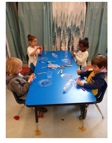
Ms. Karen's Kindergarten students created a <u>Dale Chihuly inspired art work</u> for Under the Snow Moon.