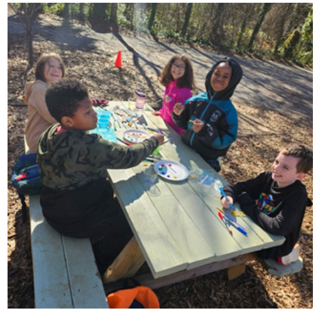
Blend students create a collaborative art project for Under the Snow Moon!

Thank you to everyone in the Pioneer Springs community who participated in the February 6 blood drive. One Blood collected 11 units of blood, which will benefit up to 33 lives!