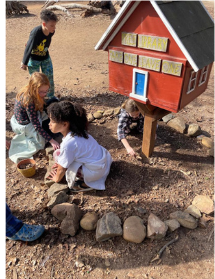
Update from last week-4th grade continues to work on beautifying the area surrounding the Little Free Library at Croft. Isn't their Kindness Rock Garden beautiful?