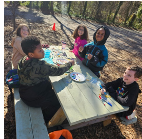
Blend students create a collaborative art project for Under the Snow Moon!

Thank you to everyone in the Pioneer Springs community who participated in the February 6 blood drive. One Blood collected 11 units of blood, which will benefit up to 33 lives!